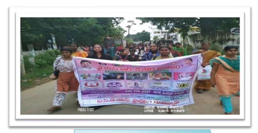
YSR Kishori Vikasam Rally

The NSS Units: I & II of AG & SG Siddhartha Degree College of Arts & Science (Autonomous), Vuyyuru organized the YSR KISHORI VIKASAM Rally to help teenagers to control their mood swings, on 11-10-2019 in Vuyyuru town with the collaboration of ICDC PROJECT VUYYURU. Volunteers of NSS units – I & II participated in this activity from their homes. 80 Volunteers participated in this activity.