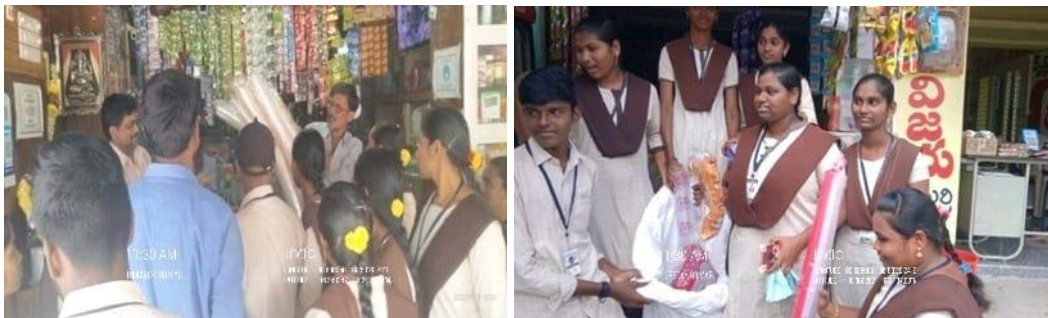
To Avoided Plastic Materials in Vuyyuru Market

Brief Report: NSS Unit I & II volunteers has been organized programme “To Avoided Plastic Materials in Vuyyuru Market” on 15-04-2023. 58 NSS volunteers are participated.