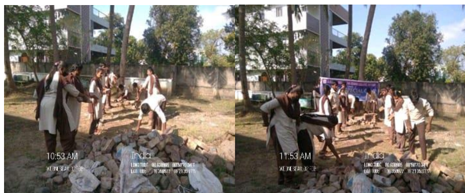
N.S.S Special Camp in the China Ogirala village

N.S.S Special Camp has been organized in the nearby village China Ogirala on 14/01/2022. Volunteers of N.S.S units – I & II rendered their services in the village China Ogirala , The NSS units Organized Clean and Green programme to the high school surrounds. 44 NSS volunteers participated.