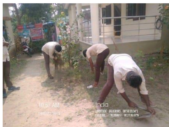
N.S.S Special Camp in the Mullapudi village

Brief Report: N.S.S Special Camp has been organized in the nearby village Mullapudi on 14/01/2022. Volunteers of N.S.S units – I & II rendered their services in the village Mullapudi , The NSS units Organized Clean and Green programme in the sachivalayam campus. 51 NSS volunteers participated.